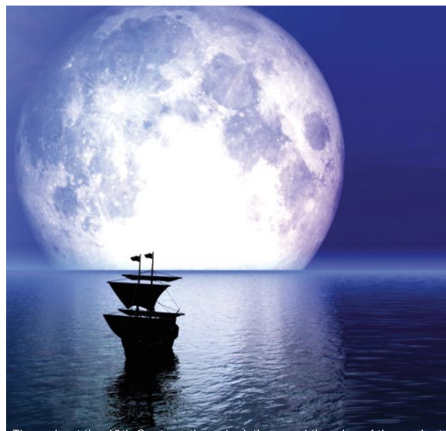
Throughout the 16th Century, the calculations and theories of the ancient Greek and Egyptian mathematicians and astronomers served as the basis of cosmology, even as new discoveries undermined time-honoured assumptions.[...] To reach his goal, Magellan would have to master both a great Ocean Sea and a sea of ignorance. [...] His sophisticated approach to navigating uncharted waters went far beyond technical ability in boat handling and direction finding; it revealed an ability to deploy novel tactics to overcome one of the great challenges of the Age of Discovery: namely, how to guide a fleet of ships through hundreds of miles of unmapped archipelagos in rough waters." Laurence Bergreen, Over the Edge of the World – Magellan's Terrifying Circumnavigation of the Globe, 2004

Boyd's central point was that the decision cycle is the central mechanism enabling adaptation (apart from natural selection) and is therefore critical to survival. OODA uses discipline to drive learning, adaptation and innovation, forcing decision-makers to consider the real strategic challenges, not the old assumptions. Again, for this new pattern to emerge, leaders must fully accept that now the quintessence of their responsibility is to map new routes through unknown stormy territories. This will require solid, innovative